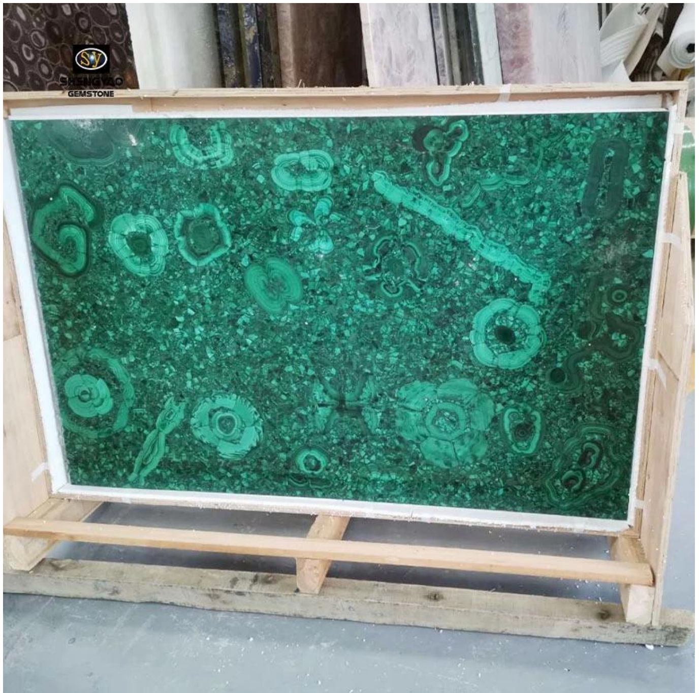
Green Malachite Slab

The next generation of Semi-precious slabs and tile: Malachite features semi-precious stone in intense green tones. It brings a vibrant and dramatic flair to any project. Available in slabs. Also available with gold and silver accents