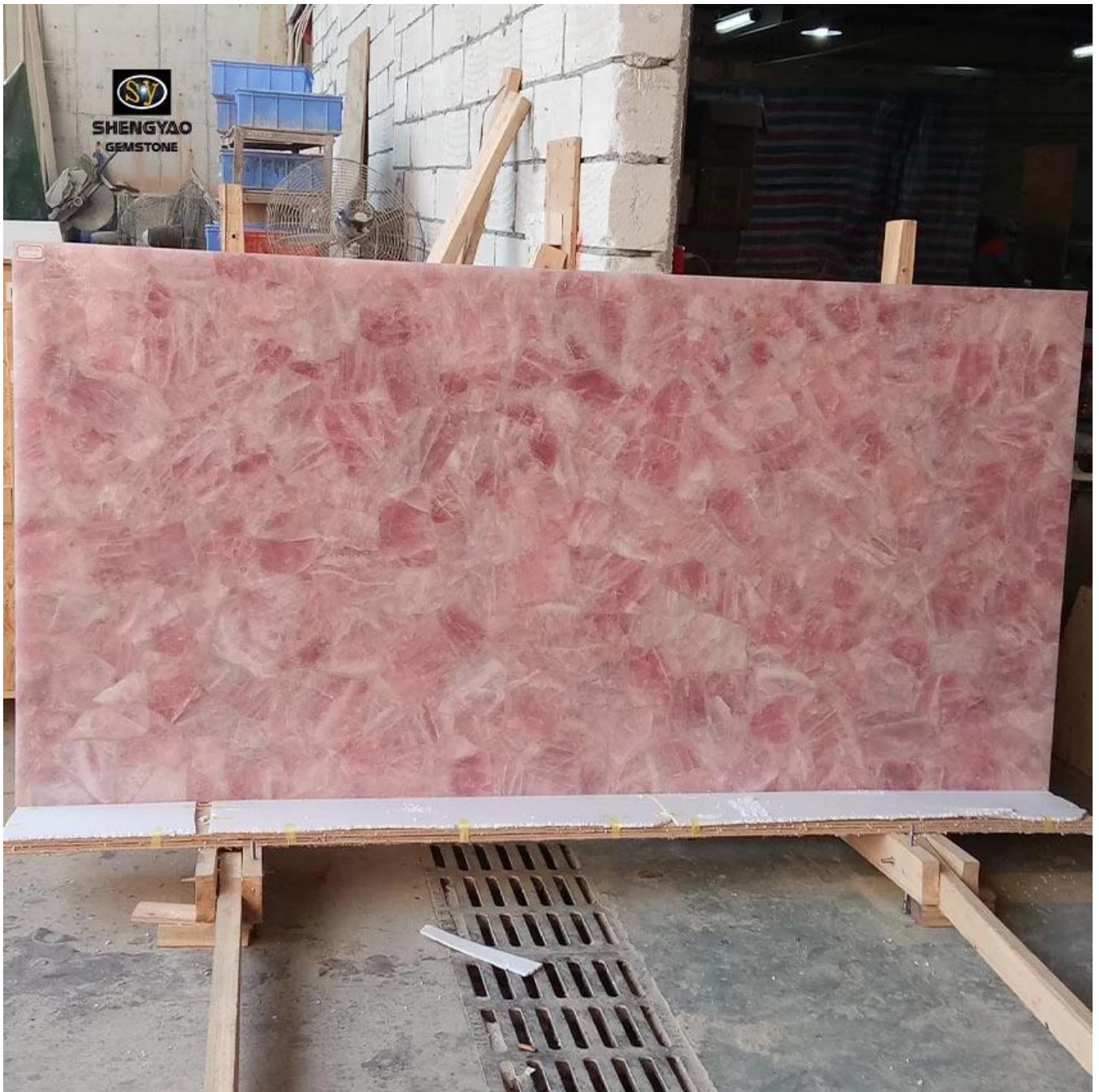
□rose quartz slab□