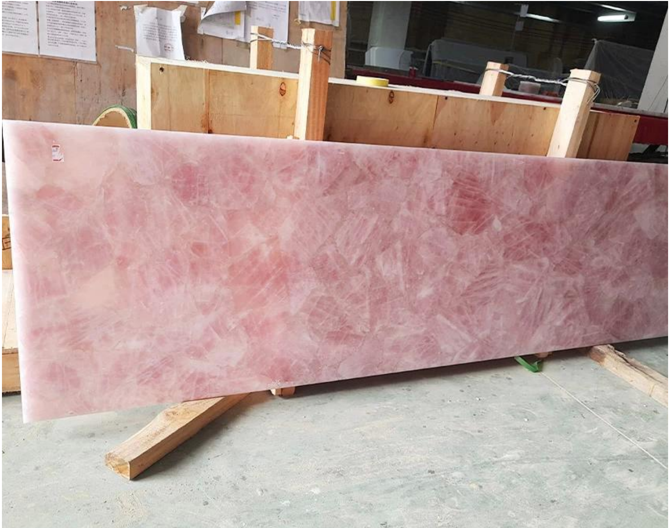
□rose quartz slab□

for its love symbol. Brittle texture of Rose Quartz, which contains a titanium element due to the formation of a trace amount of pink, pure quartz allows a wavelength range of ultraviolet, visible and can make infrared rays pass, with optically active, such a piezoelectric and electrostrictive properties. can be semipermeable, transparent and translucent, but very clear and bright natural crystals, we call it Star Rose Quartz. (Origin: Brazil, Madagascar)(Backlit)