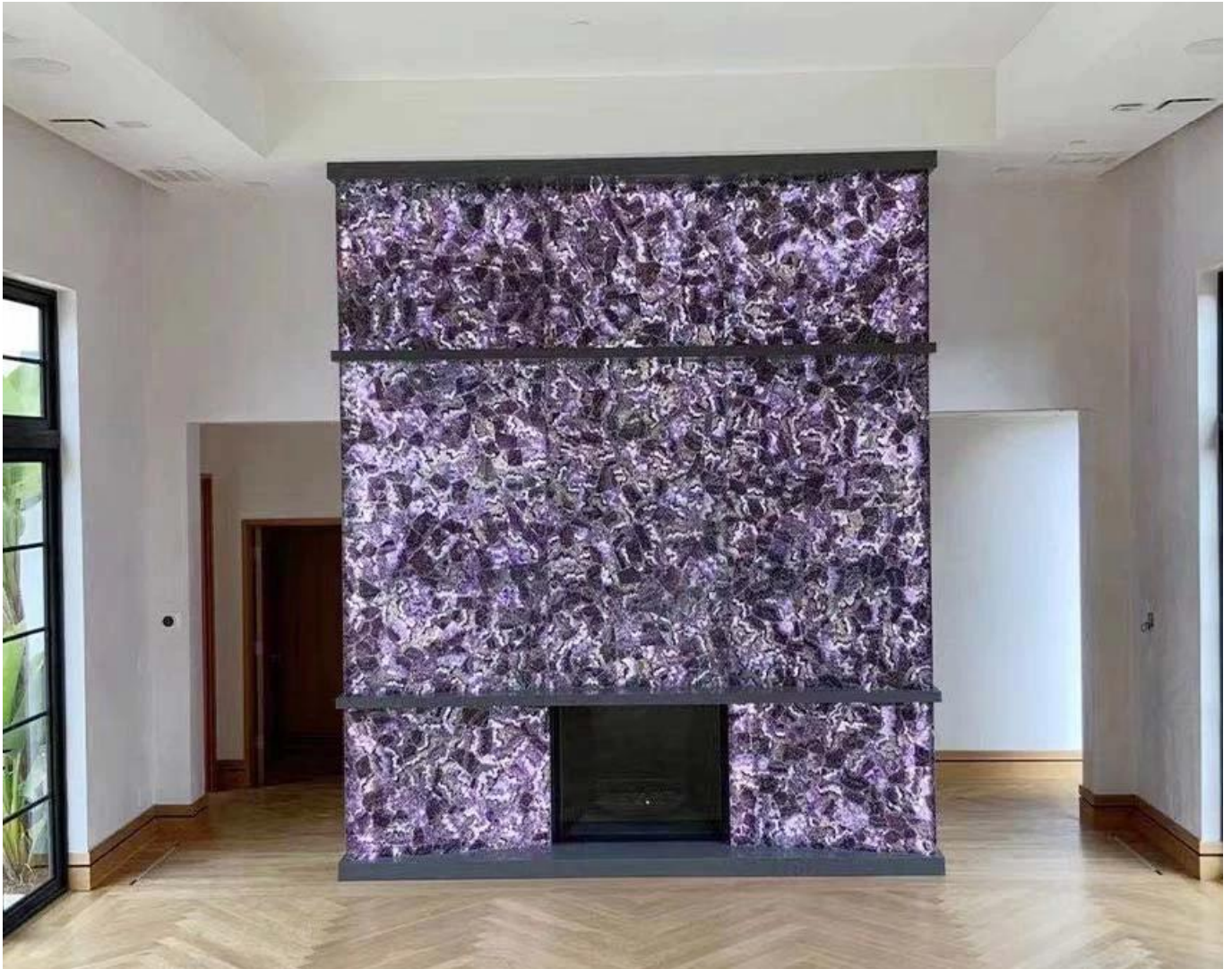
□Amethyst slab is used in fireplaces□

Shengyao Gemstone is a leading manufacturer and supplier of the best quality semi precious stone slab in China. There are dozens of semi-precious stones slab wholesale .