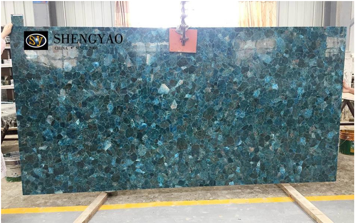
polishing gemstone slab manufacturer China

Apatite Semi Precious Stone Slab is a new gemstone decoration slab, with a unique cyan, between blue and green. Mainly used in the background wall, floor, furniture and other decoration above.