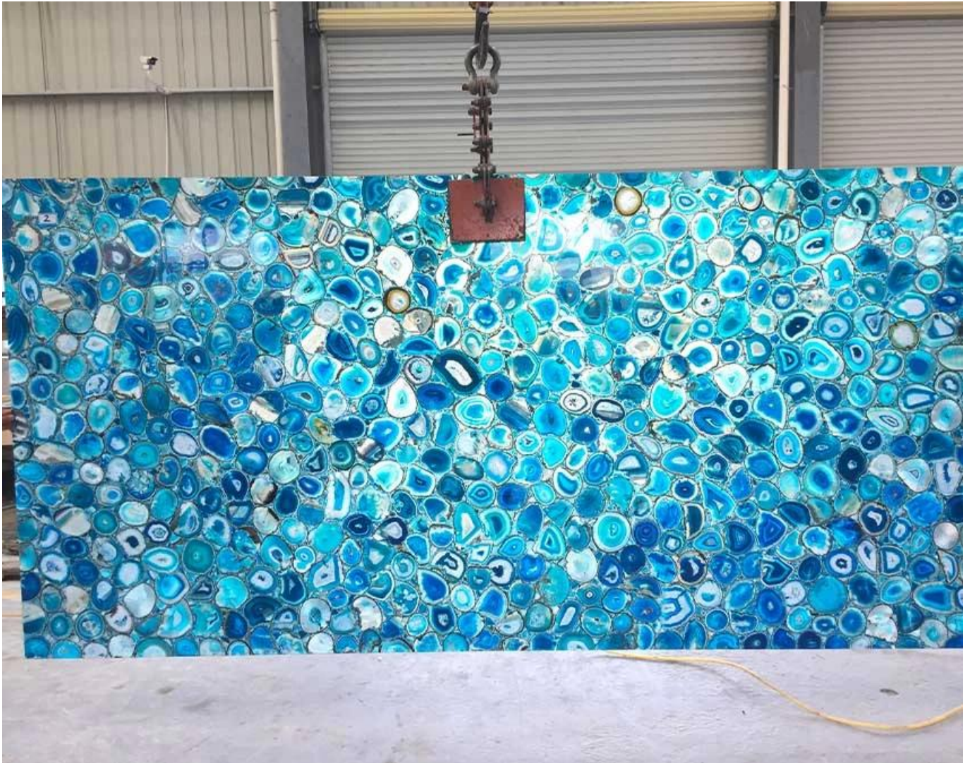
□blue agate Gemstone Slab□