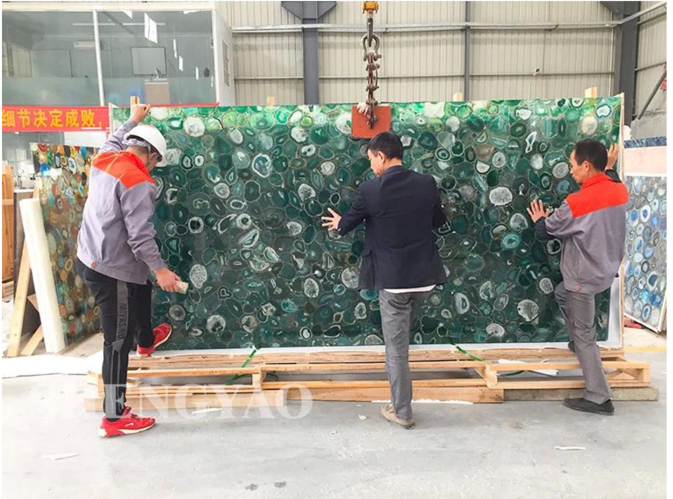
□green agate slab packaging□

Shengyao Gemstone is a leading manufacturer and supplier of the semi precious stone slab in China. We are a quality Gemstone Slab factory and semi precious stone slab wholesaler .