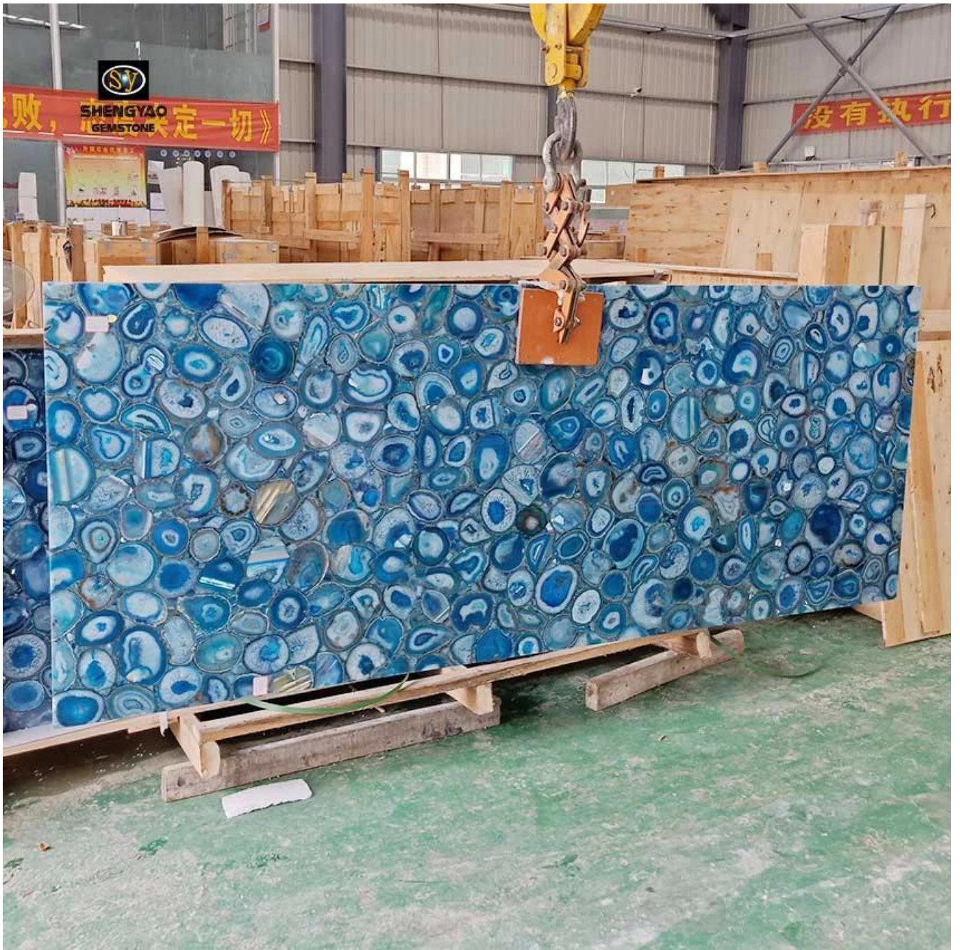
□blue agate Gemstone Slab□