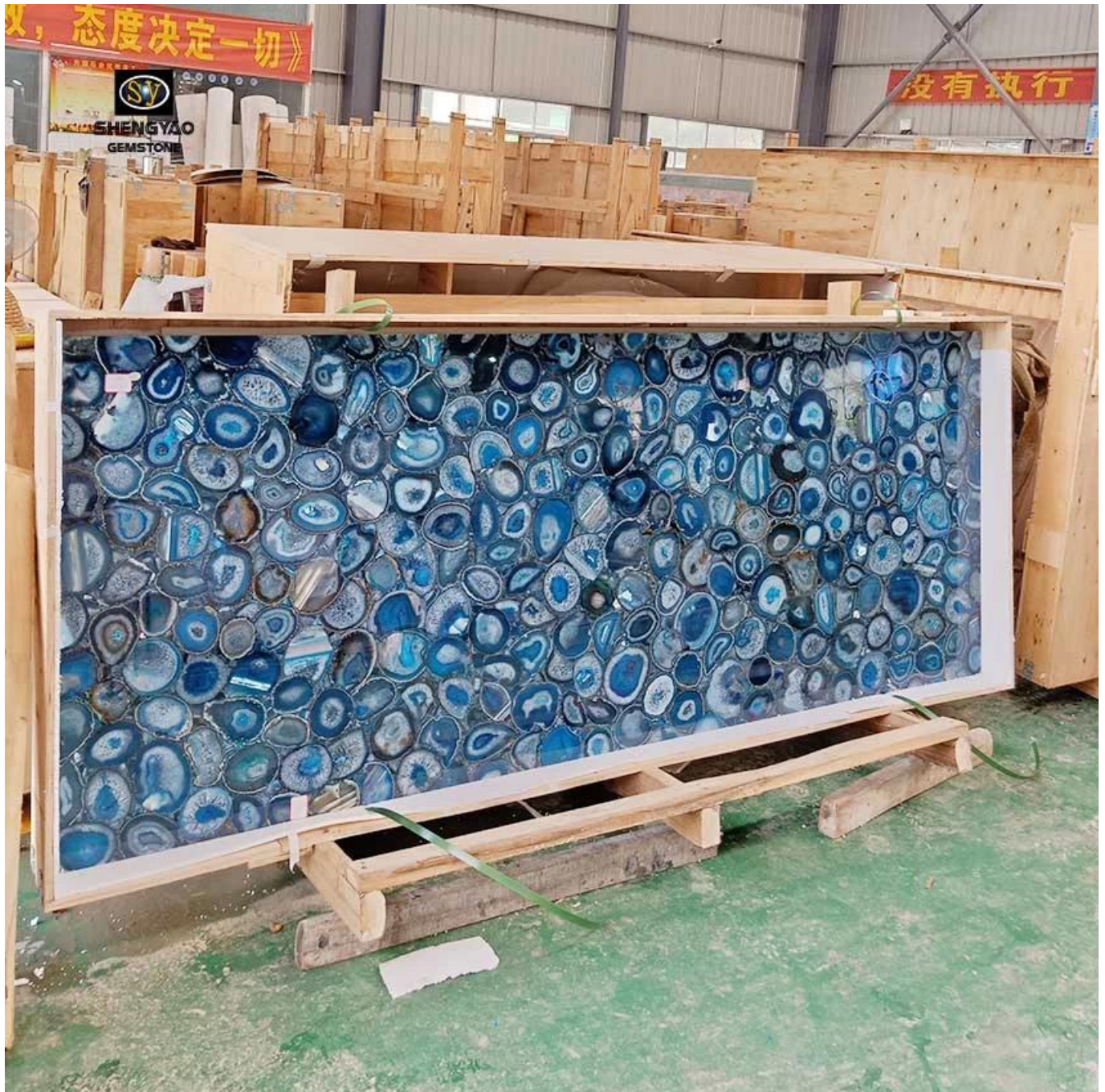
□blue agate Gemstone Slab□

Agate is polycrystalline, with glass and oil shiny surface, natural texture and smooth, gradient color brings strong sense level, distinct bands, while agate is one of the seven treasures of Buddhism, since ancient times treat as a talisman , amulet, a symbol of friendly love and hope, help to eliminate stress, fatigue, sewage and other negative energy, the flexibility that will help business growth, strong financial resources. (Origin: Brazil, Uruguay, India, Argentina )□Backlit□