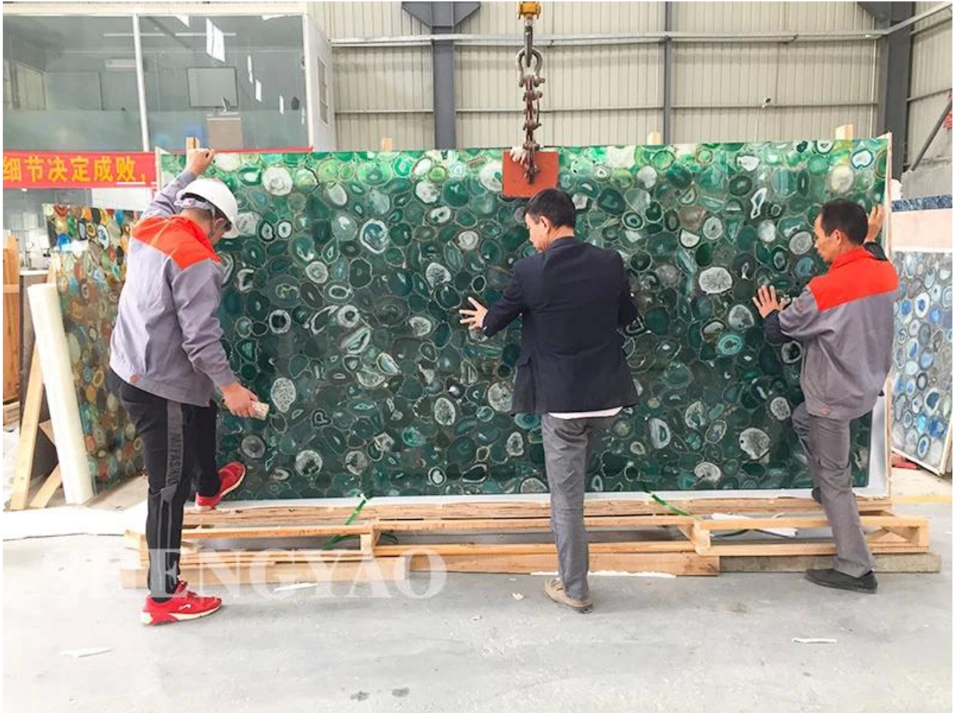
□green agate slab packaging□

Shengyao Gemstone is a leading manufacturer and supplier of the semi precious stone slab in China. We are a quality Gemstone Slab factory and semi precious stone slab wholesaler.