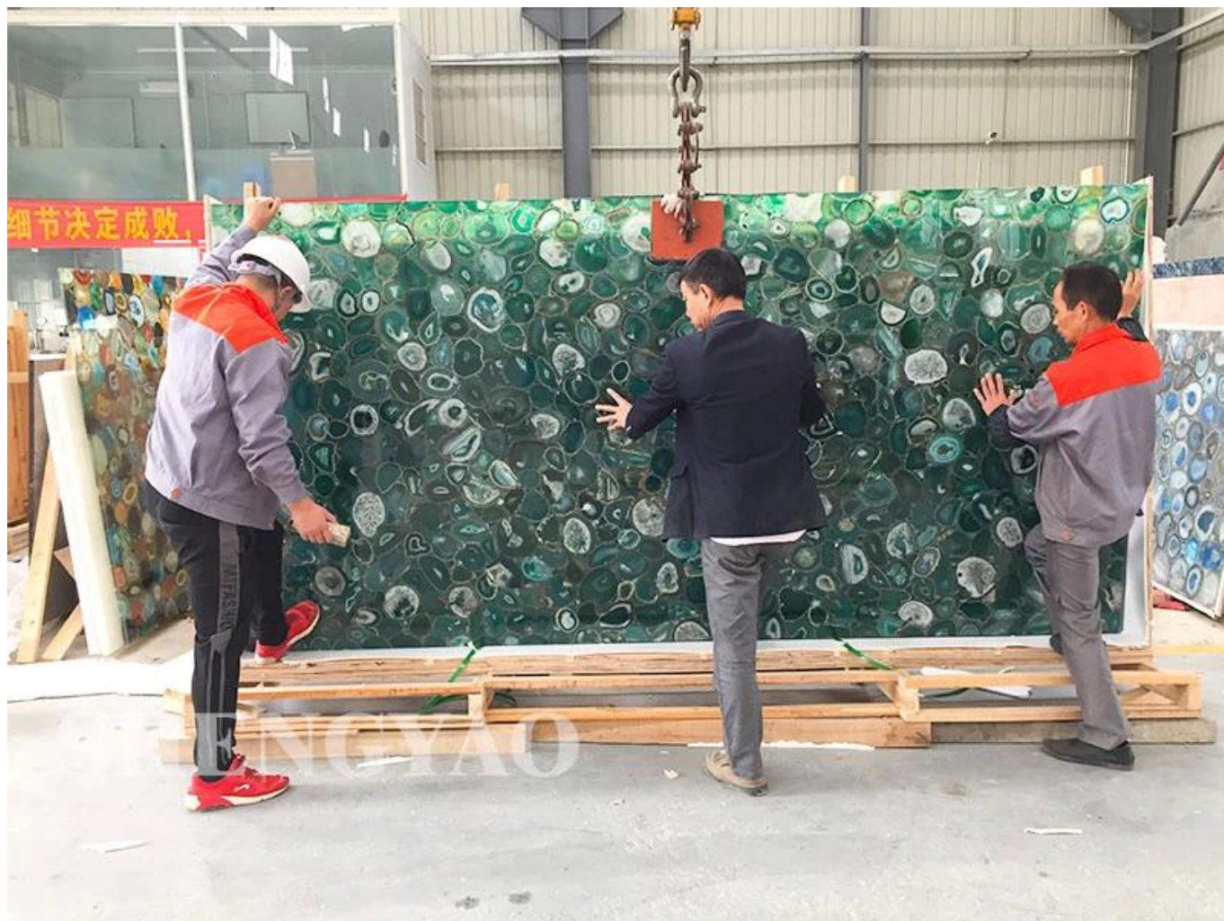
□green agate slab packaging□

Shengyao Gemstone is a leading manufacturer and supplier of the semi precious stone slab in China. We are a quality Gemstone Slab factory and semi precious stone slab wholesaler.