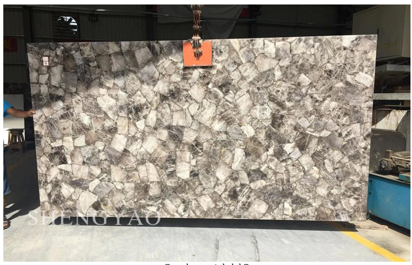
☐smoky crystal slab ☐

Smoke Crystal (also known as smoky quartz, citrine or tea crystal) are a class of color is smoke gray smoke yellow, brown, brown crystal varieties, the color ethereal blur, beauty, it is one of the most attractive member of crystal family . the snow-covered Alps, bears the world's most pristine treasures, in 2178 meters in the surrounding rock, and buried a fascinating gemstone colors - smoky quartz (origin: South Africa, Brazil)(Backlit)