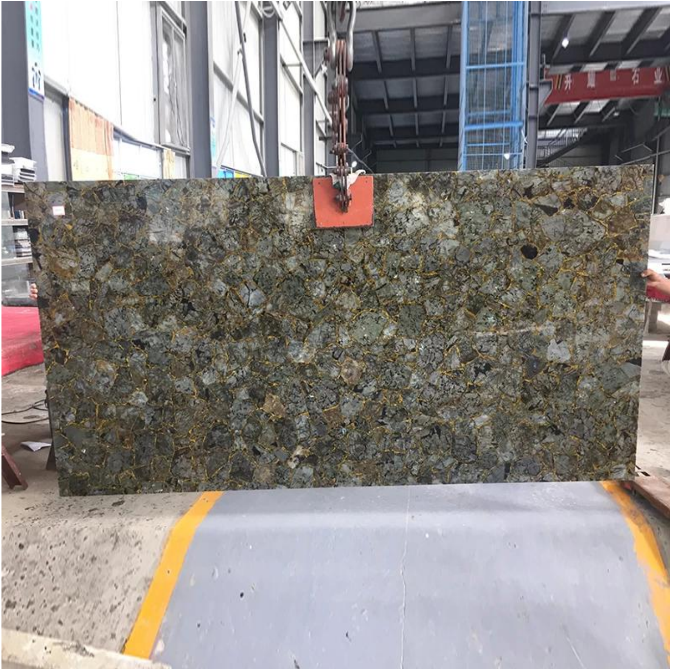
☐Luxury Labradorite With Gold Foil Gemstone Slab ☐