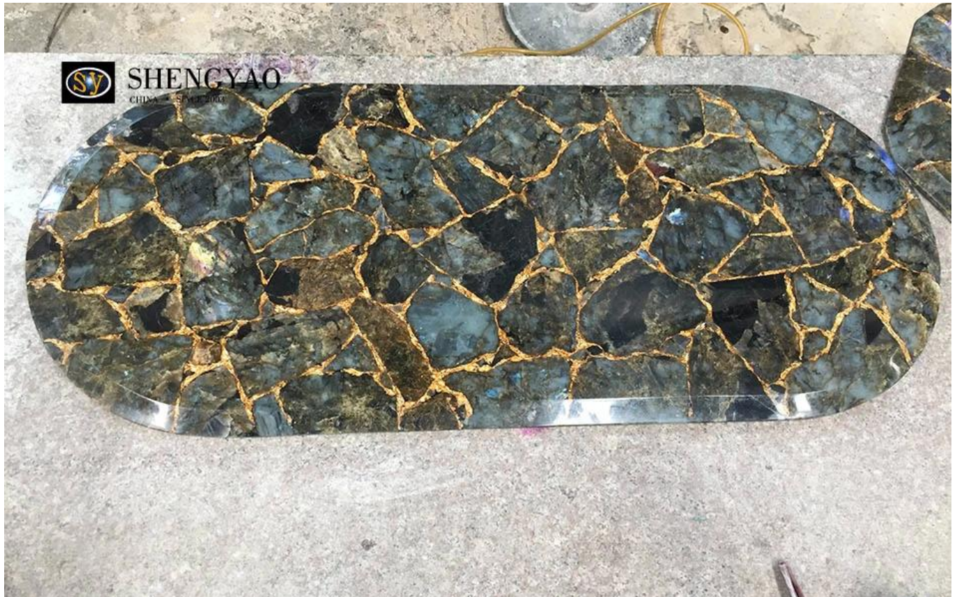
(SHENGYAO Semi Precious Stone Labradorite Countertop)

Labradorite is a feldspar mineral, Labradorite is common, iridescent. Labradorite is a gemstone, iridescent. Labradorite, spectrum, flashes. (Backlit, Madagascar)