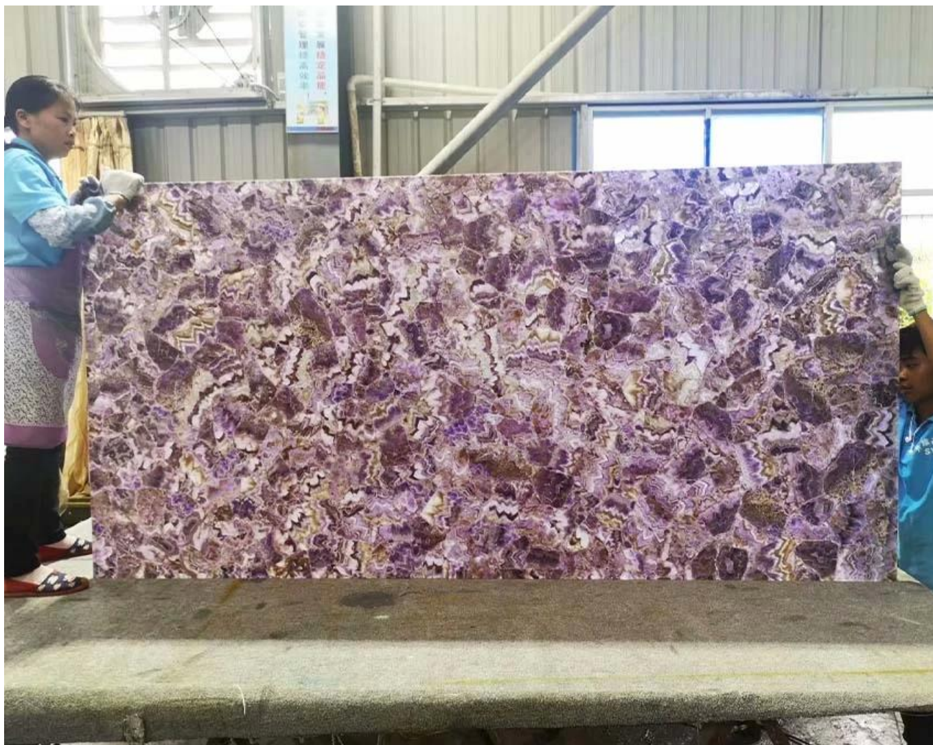
□amethyst slab backlit□

Wide range of application scenarios for amethyst slab,For example, amethyst gemstone quartz slab is used in scenes such as background walls, sinks, furniture countertops, floors, etc.