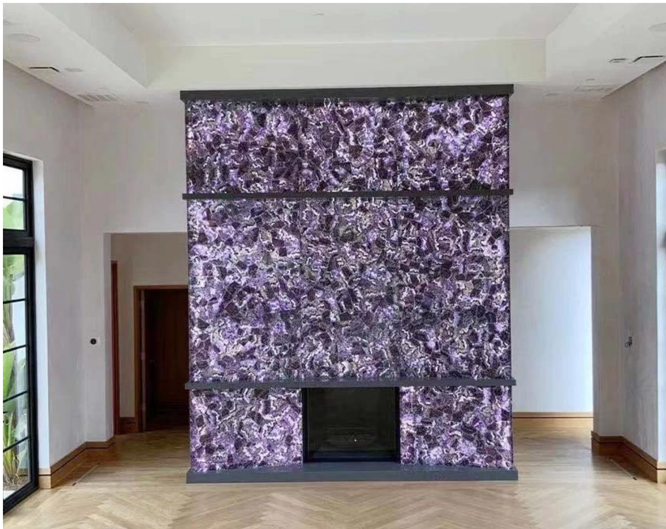
□Amethyst slab is used in fireplaces□

Shengyao Gemstone is a leading manufacturer and supplier of the best quality semi precious stone slab in China. There are dozens of semi-precious stones slab wholesale .