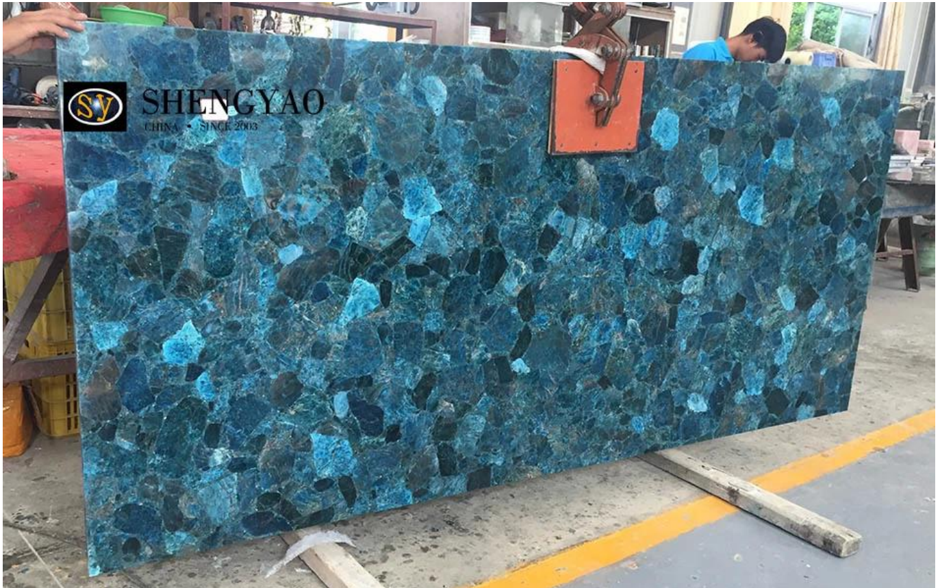
□ blue semi precious stone slab supplier China □

Apatite refers to phosphate ore in igneous rock and metamorphic rock in the form of crystalline apatite. A group of calcium - containing phosphate minerals. Apatite is in the shape of vitreous crystals, blocks or nodules, with various colors, mostly hexagonal columns with conical surfaces. The large apatite deposits are mainly shallow Marine sedimentary rocks, mainly collophanite. Such as Xiangyang in Hubei, Kunyang in Yunnan and Kaiyang in Guizhou. (Backlit)