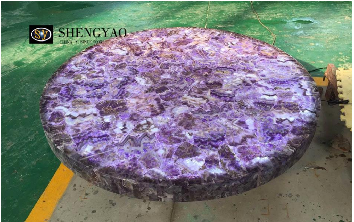
backlit amethyst countertop for sale

Amethyst is a beautiful semi-precious stone,It can be made into unique furniture countertops and backlit.The translucent amethyst stone countertop will complement your creative ideas and could be used for kitchen space, kitchen countertops, backsplash, vanity top, bar counters, etc.