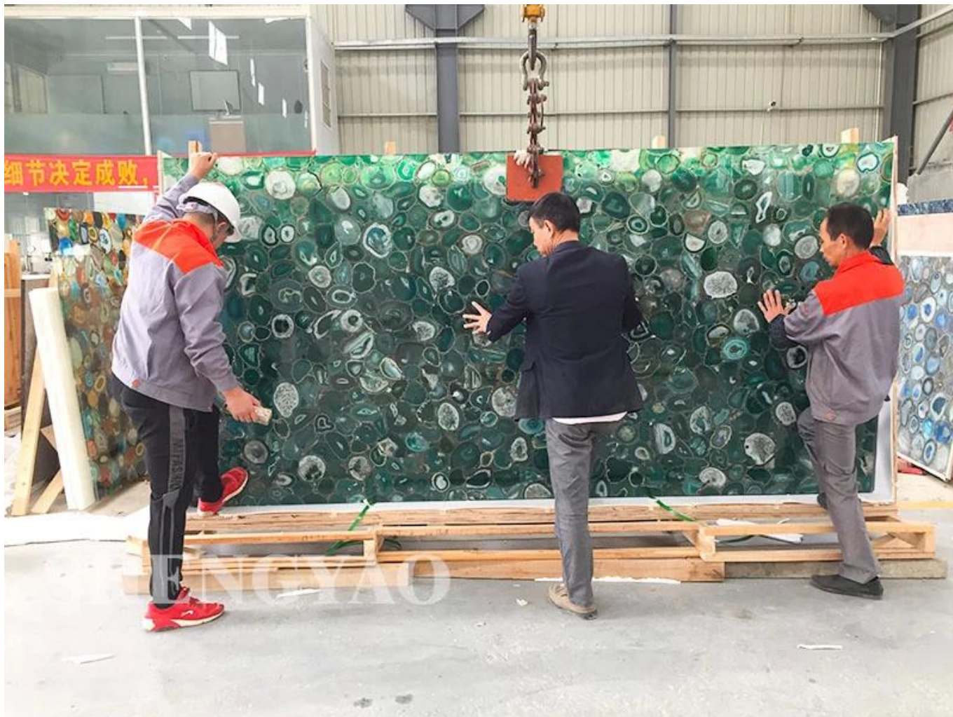
□green agate slab packaging□

Shengyao Gemstone is a leading manufacturer and supplier of the semi precious stone slab in China. We are a quality Gemstone Slab factory and semi precious stone slab wholesaler .