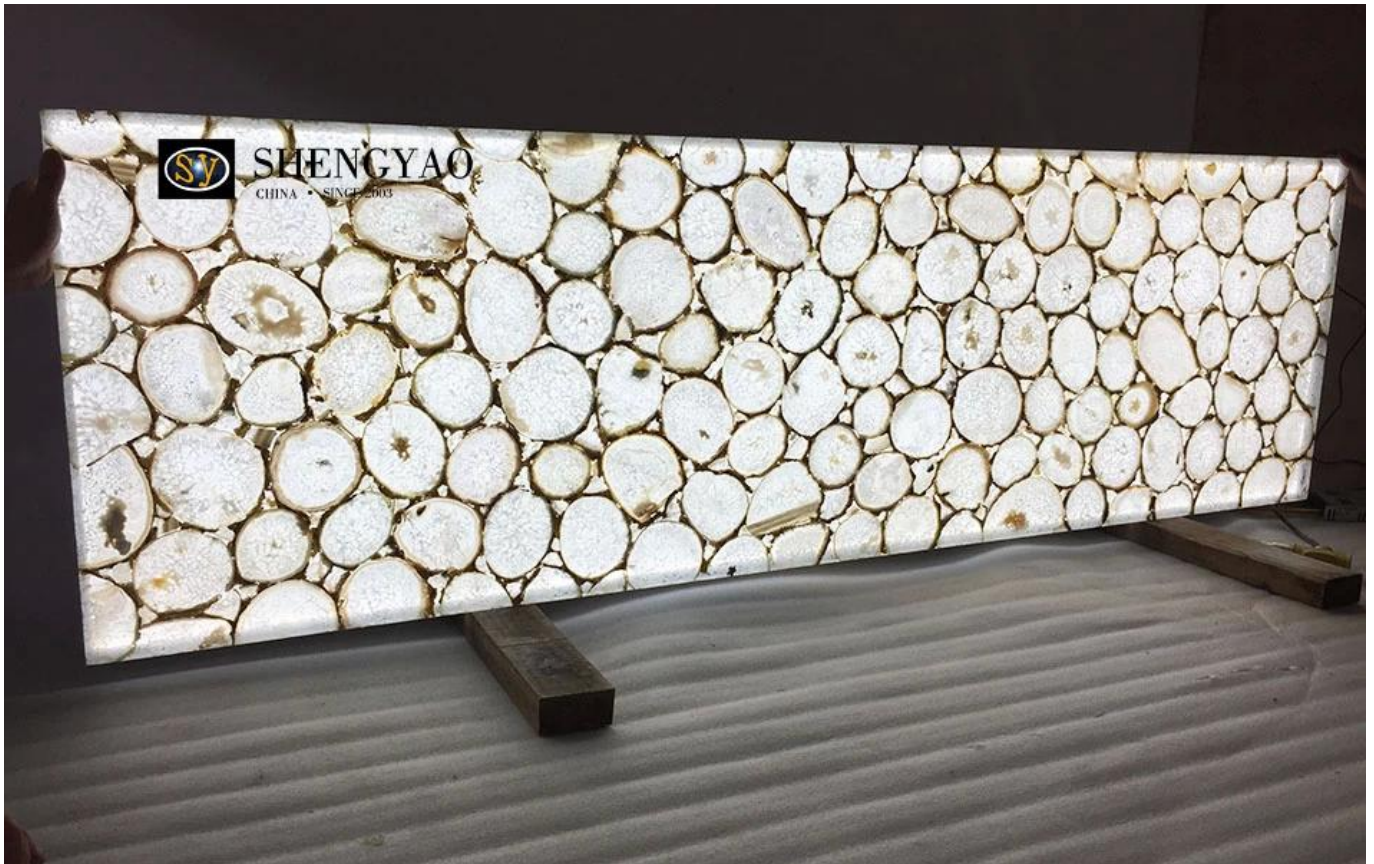
□ semi precious stone agate slab supplier China □

The backlit white agate gemstone slab is a semi-precious stone slab that is cut from natural agate and then spliced together. The white agate slab uses transparent glass as the baseplate, so that its light transmittance can be better expressed. It can be applied to many scenarios and is the best choice for designers.