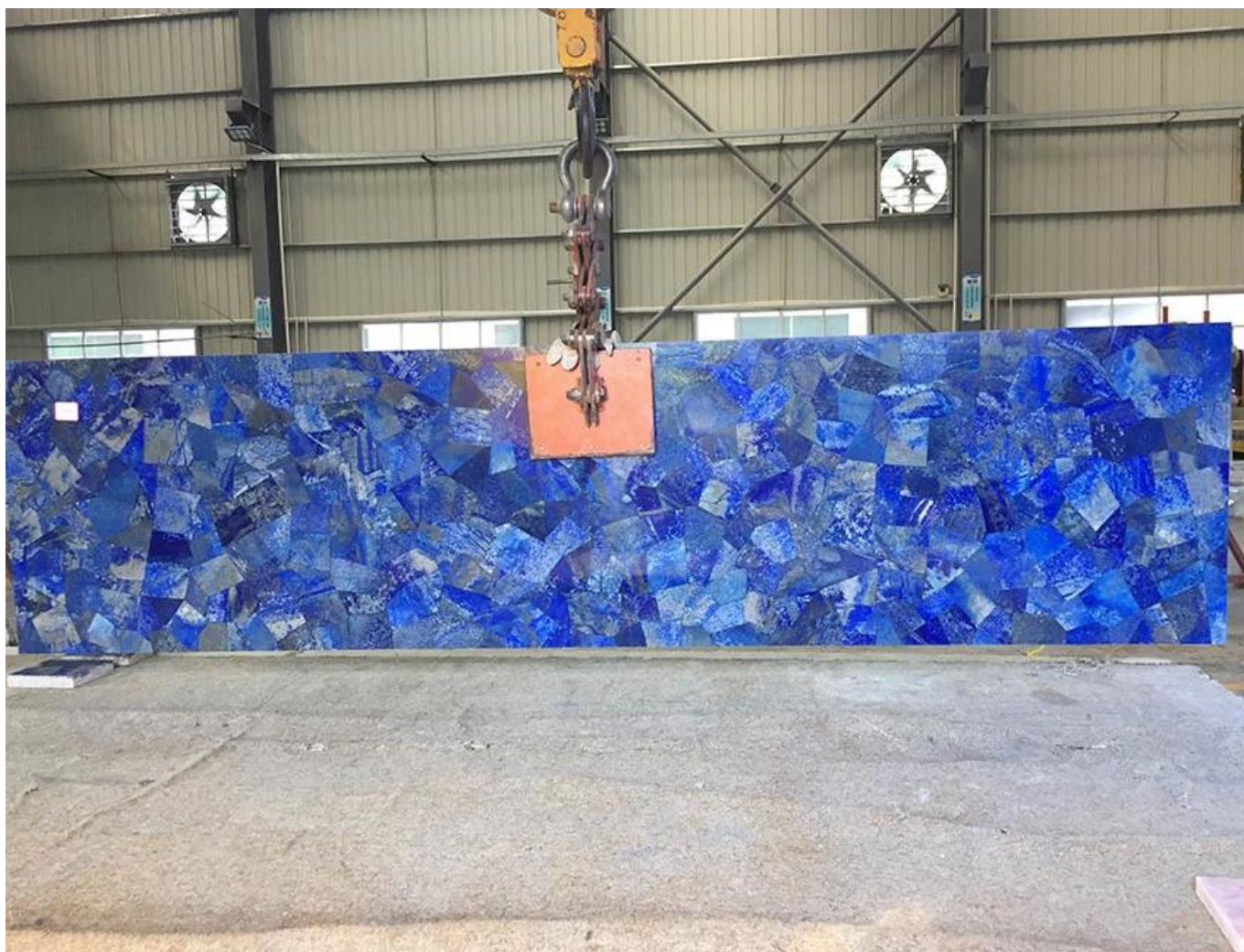
□Lapis lazuli slab□

Shengyao Gemstone is a leading manufacturer and supplier of the best quality semi precious stone slab in China. We have the flexibility to handle semi-precious stones slab. Increase the use of semi precious stones by laminated other materials, For example, glass, aluminum honeycomb, granite, artificial stone, ceramic tile and other materials. We can also process semi precious stones slab into art walls, furniture, countertops, sinks and other products.