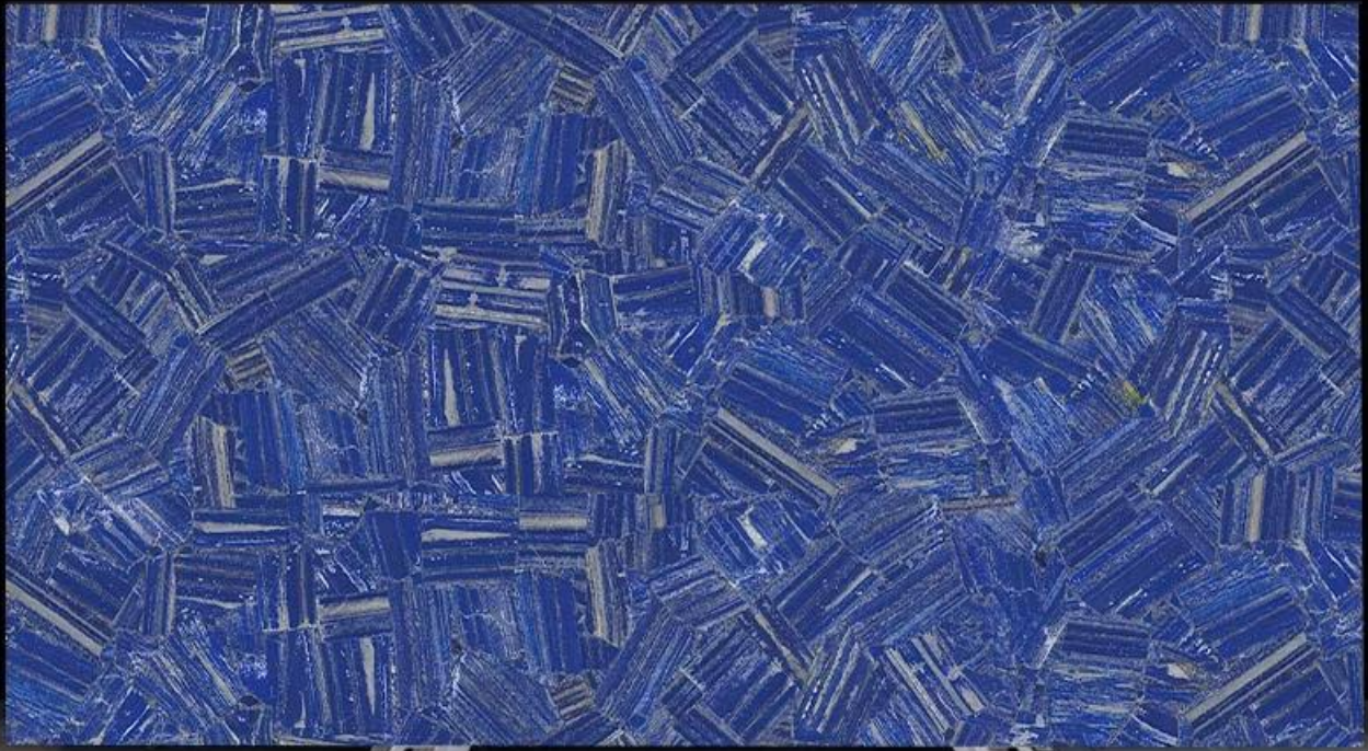
□ Lapis lazuli Gemstone slab □

Lapis lazuli presents a unique and bright blue color, with a smooth surface, fine texture, and glassy to waxy luster. The so-called "hue is like the sky" can be described as not excessive at all. Lapis lazuli slab is a popular blue semi precious stone slab .