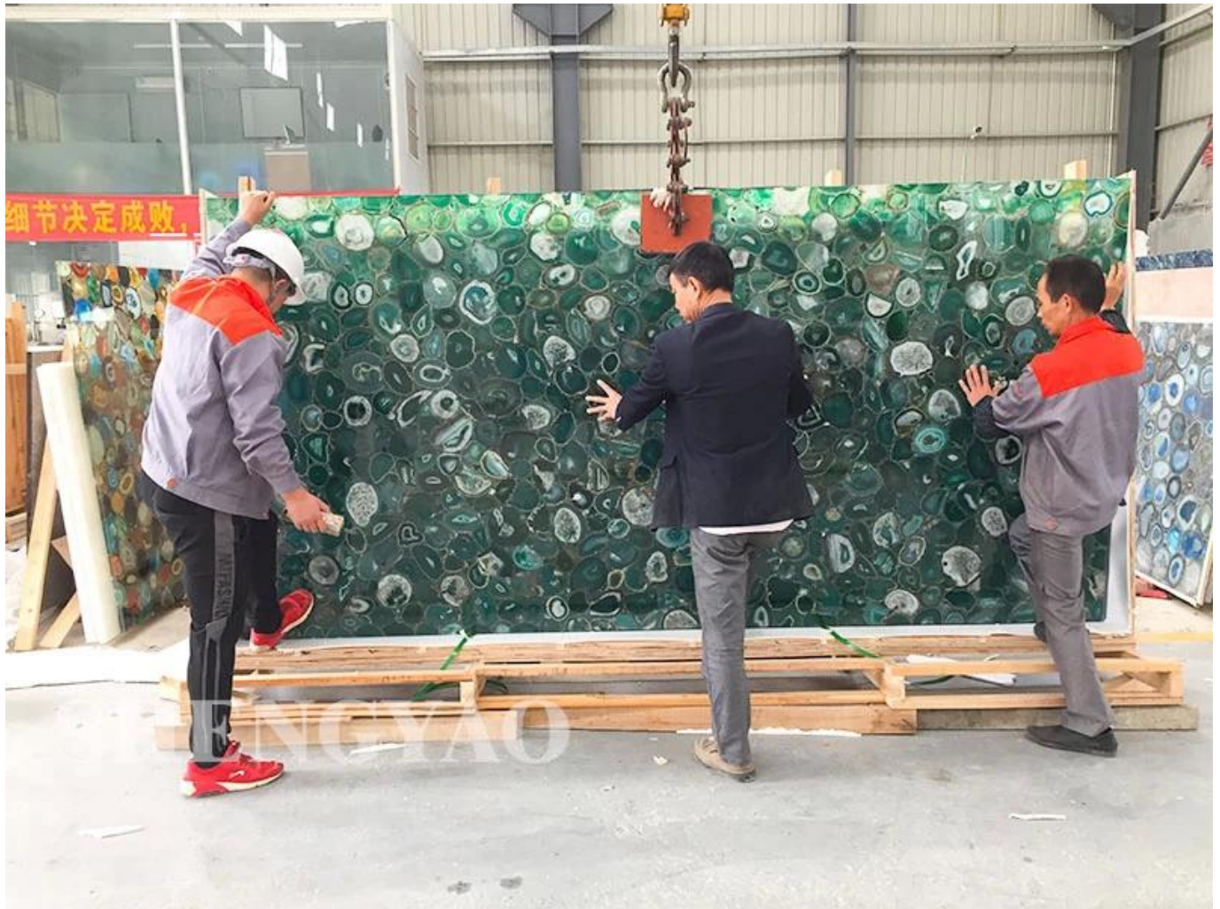
□green agate slab packaging□

Shengyao Gemstone is a leading manufacturer and supplier of the semi precious stone slab in China. We are a quality Gemstone Slab factory and semi precious stone slab wholesaler.