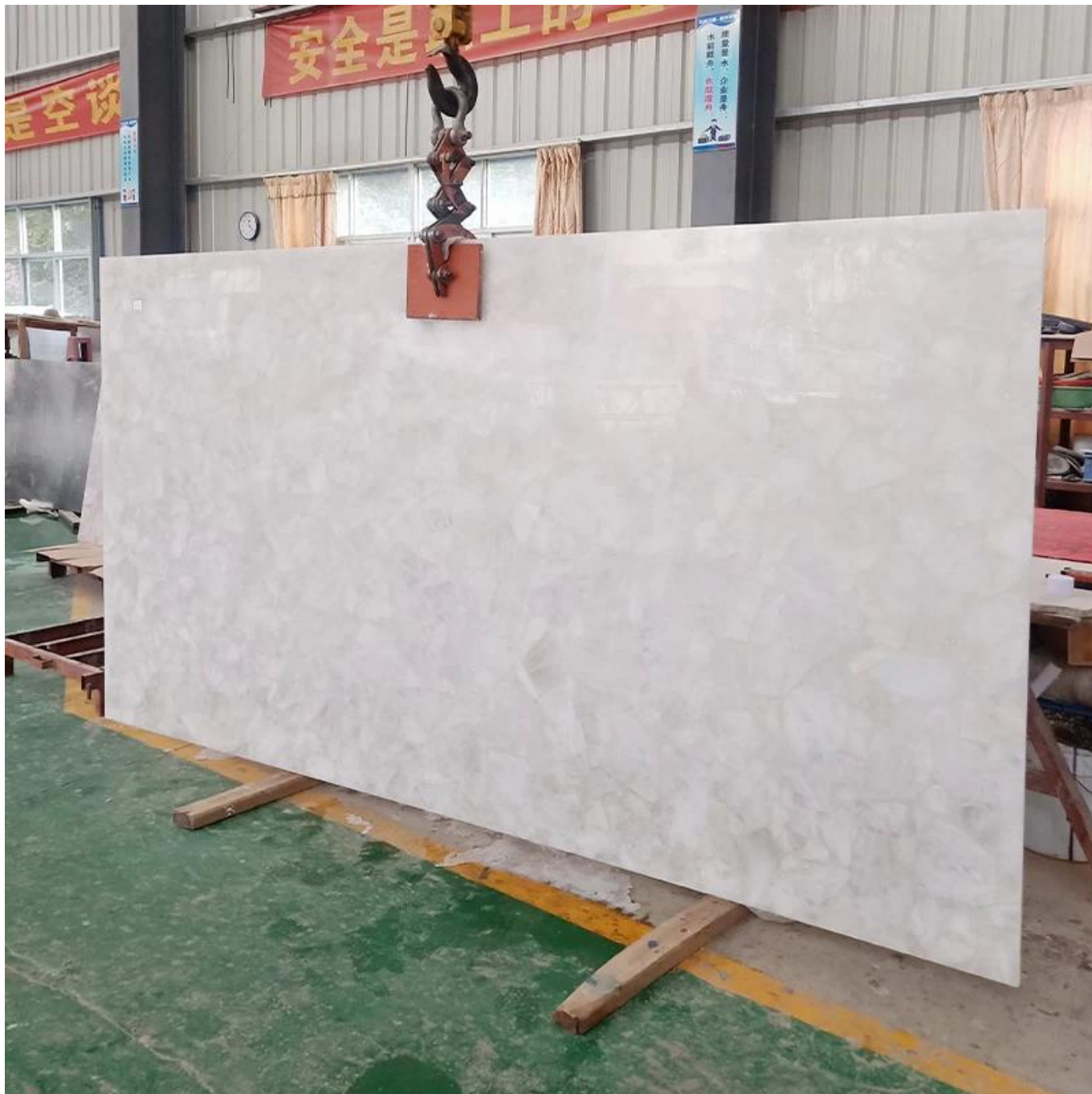
(white crystal slab)

Shengyao gemstone produced by the crystal slab can be used in many places, such as home, hotel, club, villa and other places, the application of the place is also a lot of, background wall, floor, furniture, countertop and other places.