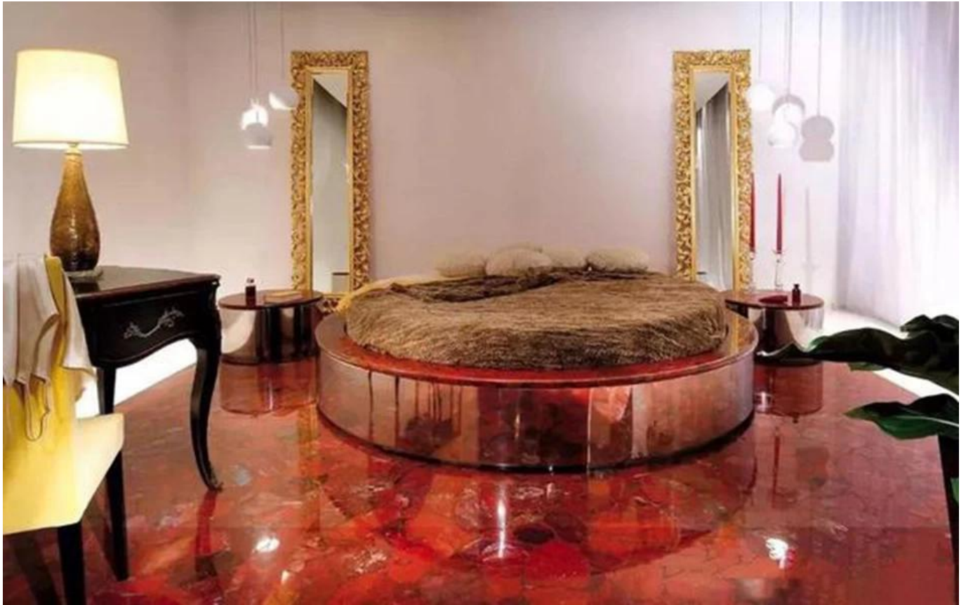
□ruby slab application□

gemstone instantly adds luxury to any room in the house,we can customize various types for you,either as a countertop,backsplash,vanity top,bar top or simply as a piece of art.Shengyao gemstone is a factory integrated product development, production, sales and service, providing professional gemstone decoration materials, gemstone furniture,a leading supplier of gemstone products in China. The ruby slab is a popular gemstone slab, which is mostly used in wall□floor□furniture and other places.