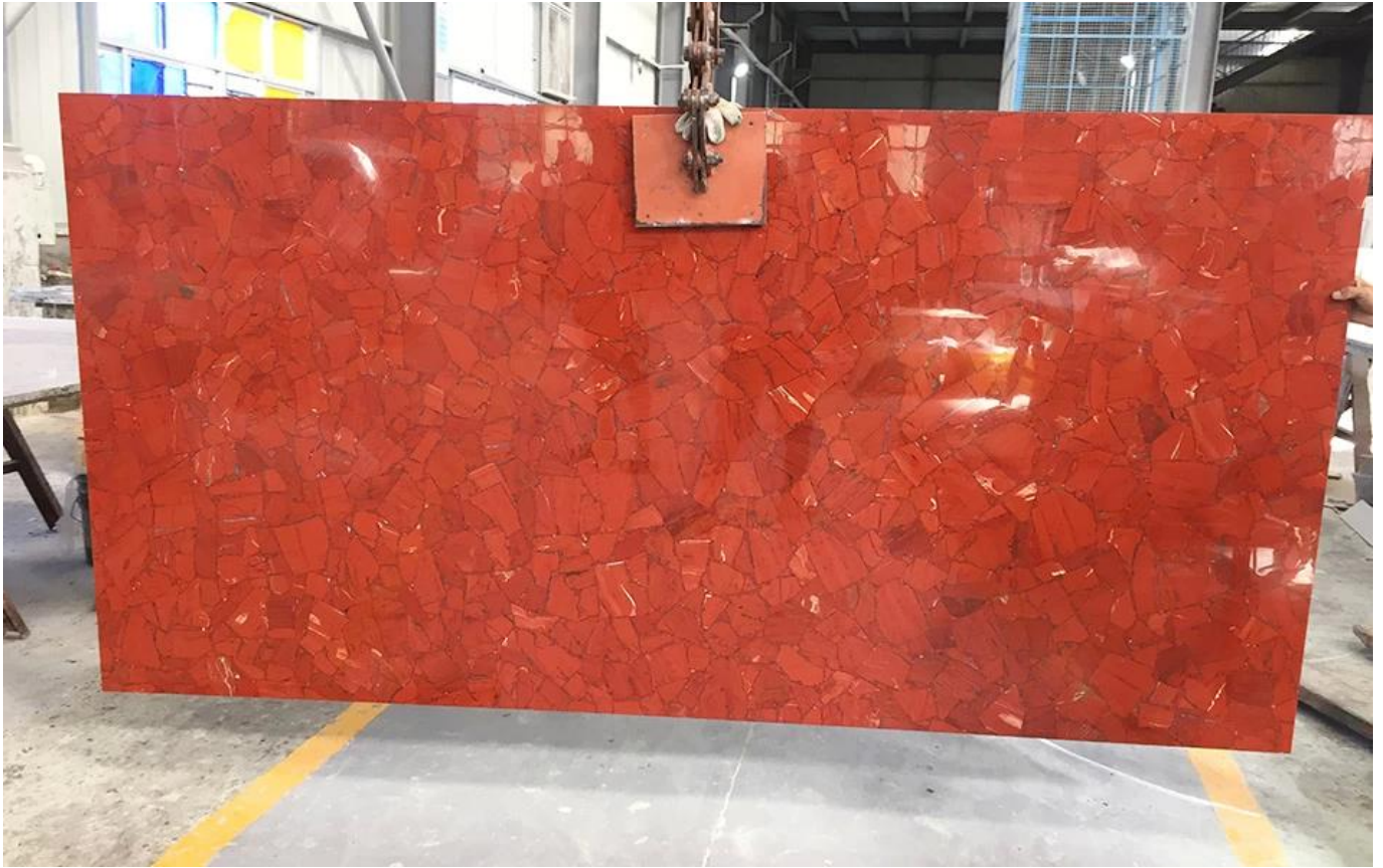
□Large Ruby Slab□